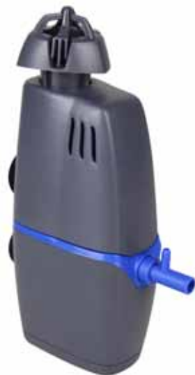
OF Hydra Nano Plus