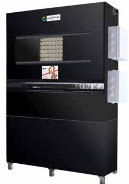
OF Hydra Koi Pond Purification System