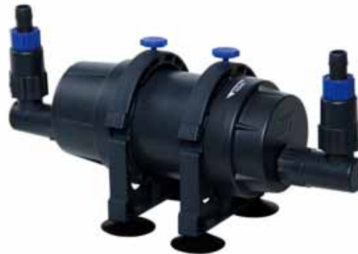
OF Hydra Stream