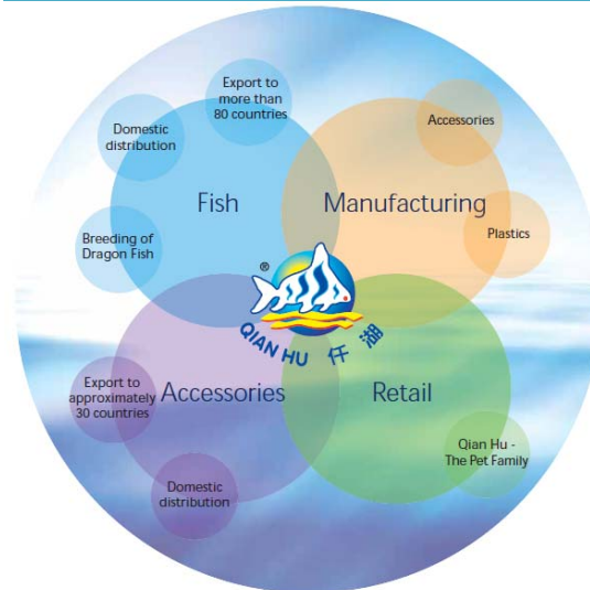
Figure 2: Diversified Business

Based on price to earnings target methodology, we maintain our target price of S$0.17 for Qian Hu. At the current price of S$0.145, we maintain "BUY". (Koh Chin Lek)