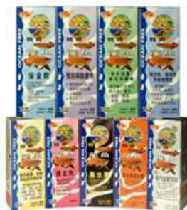
特别龍魚藥品系列 Special Arowana Medication