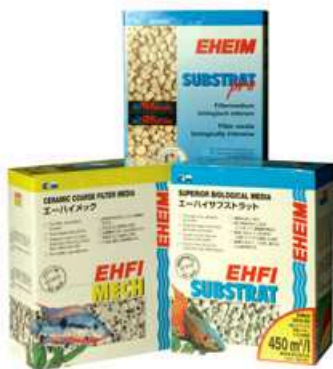
EHEIM Filter Media