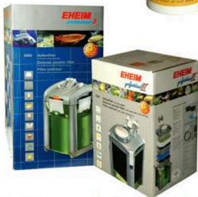
EHEIM External Canister Filter